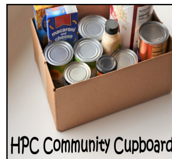
HPC Community Cupboard

Our biggest need is for health/self care items such as deodorant, toothbrushes, toothpaste, shampoo, etc. Even the small sample sizes are in demand. SNAP doesn't cover these items.